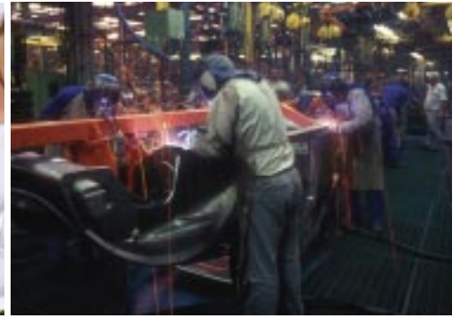
Over 50 employees